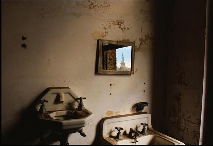
Ross Mix, 2017 Second Place

Third Place $100 Cash Award Honorable Mentions (3) $50 Gift Certificate to B&H Photo