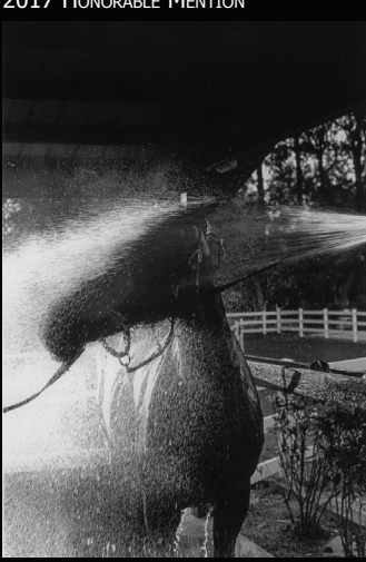
NATE DIGHT, 2017 HONORABLE MENTION